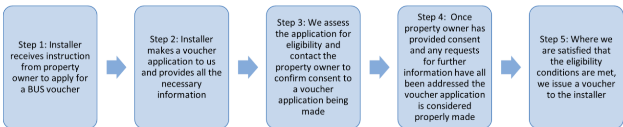
Figure 2 – Stage 1, voucher application process

5.7. The first stage of the BUS application process is the voucher application. Installers can create and submit voucher applications online via the digital BUS portal. 101