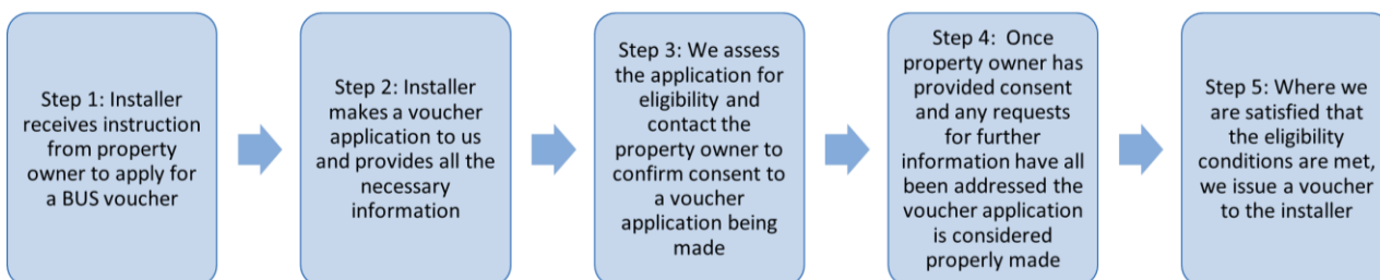
Figure 2 – Stage 1, voucher application process

5.7. The first stage of the BUS application process is the voucher application. Installers can create and submit voucher applications online via the digital BUS portal. 101