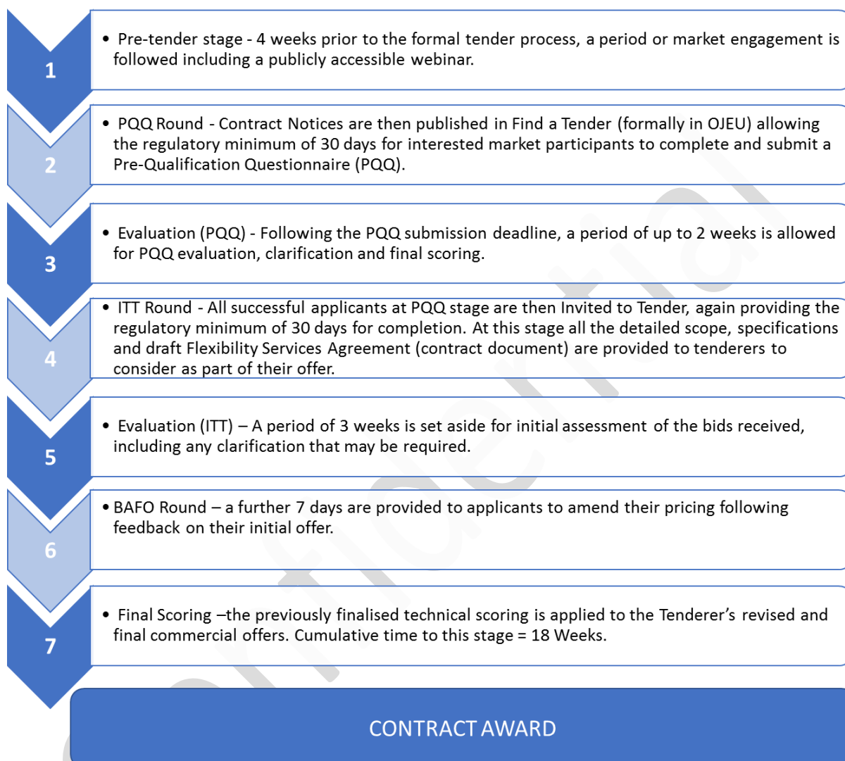
Figure 4 – SSEN Distribution Contract award process

At the point of Contract Award, the time taken to finalise contractual details can vary, but this is mitigated through the use of standard / common clauses as per the ENA Open Networks Standard contract (Version 1.2, released in February 2021). SSEN is a leading party on the production of this industry standard contract, implementing it in any new tenders and uploading the latest approved version as soon as it is signed off. This contract can be accessed through our Flexible Connections webpage: