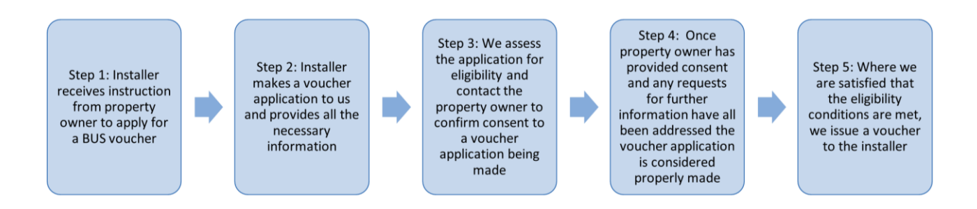
Figure 2 - Stage 1, voucher application process